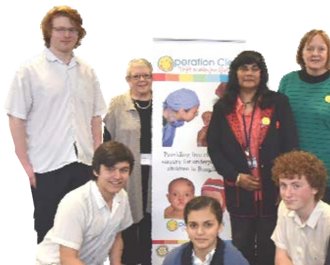
Bentleigh Secondary College students and staff pictured above after another successful Spellathon.

Winners will receive a personalised engraved medal at an awards night (sponsored by Moorleigh Moorabbin Rotary Club) to be held in December.